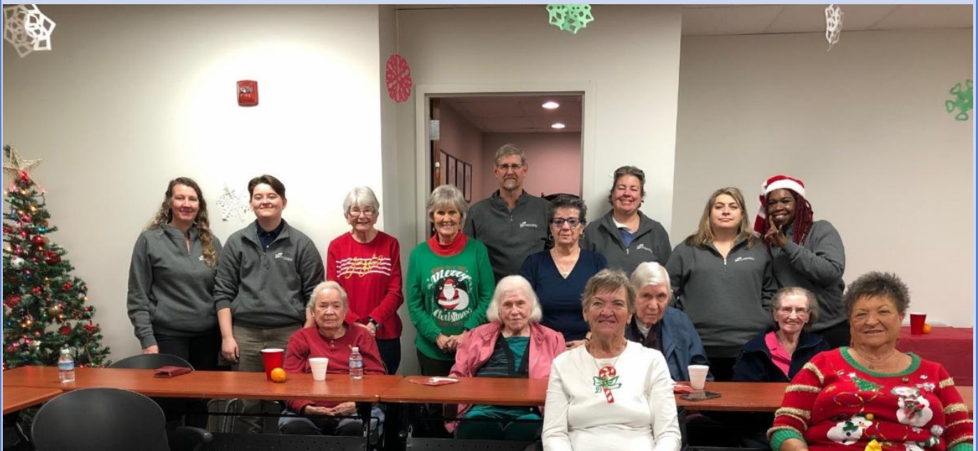
Silent Fingers members and GCDHH staff at the Christmas lunch

This month, Silent Fingers - a local group of Deaf Senior Citizens - held a Christmas celebration at the GCDHH office. They enjoyed good food and good company and wanted to thank GCDHH for the continued support. If you are interested in joining Silent Fingers, contact them through their Facebook .