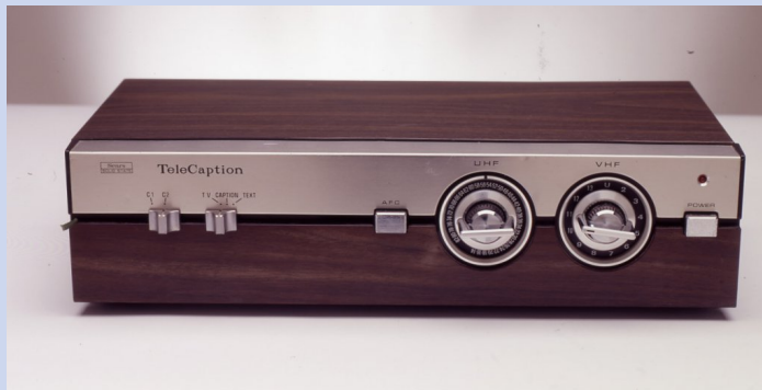
Sears Telecaption Device from 1980

Did you know that we have a small 'museum' of Deaf technology in our office? We are looking for the first Telecaption machine made by Sears in 1980 to add to our collection. If you have one, please consider donating it to us so we can proudly display it in our office!